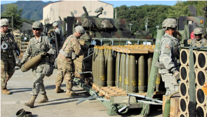
Soldier draw 155mm Base Burn Dual Purpose Improved Conventional Munition rounds, each weighing nearly 100 pounds, and carry into their vehicles during a load exercise.