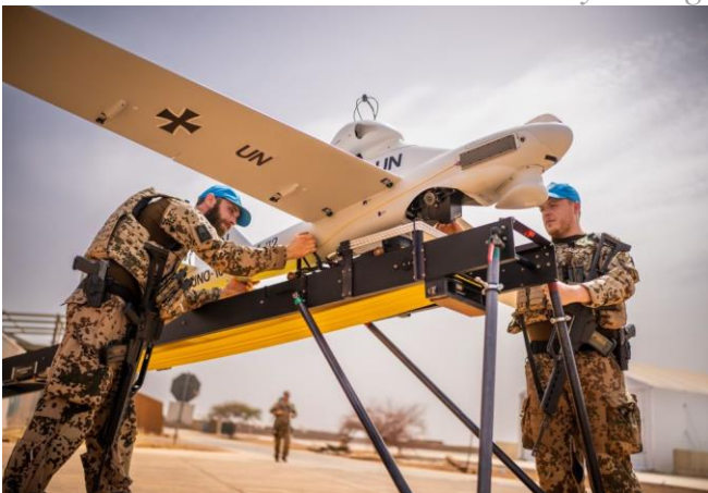
Soldiers of the German Armed Forces check a Luna drone at the German Armed Forces Camp Castor.