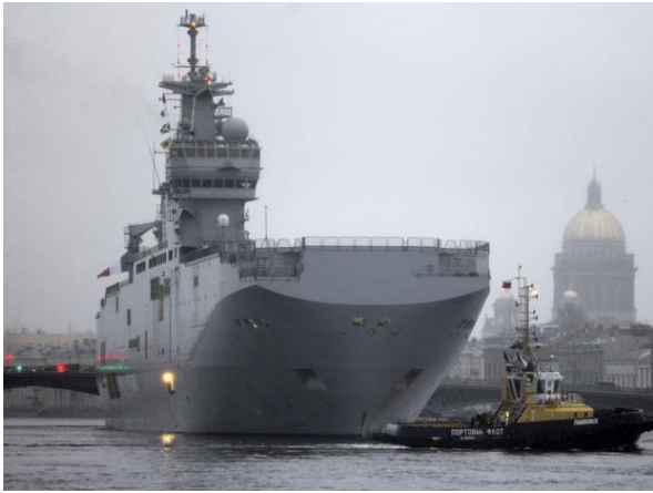
French Mistral-class helicopter carrier docks on the Neva River in downtown St Petersburg, Russia, on November 23, 2009, with one of the city landmarks, St. Isaac's Cathedral, in the background. Canada was actively pursuing at the political level the possible acquisition of the controversial French-built Mistral-class helicopter carriers, several defence, diplomatic and military industry sources have told The Canadian Press.

abroad for battle, peacekeeping or humanitarian relief. The Mistral-class helicopter carriers are suited to all three roles and were available at a once-in-a-lifetime price. And yet there is little chance Canada could have made effective use of the ships, even if we did buy them. The Royal Canadian Navy is in a disastrous state, struggling to deal with what it has. It's hard to imagine how it could have successfully integrated entirely new capabilities in this dark period of retraction. There is the odd bright spot. Canada's dozen Halifax-class frigates are in the midst of a mid-life refit and modernization. These are first-rate warships and will serve Canada well for decades. But that's about it. Our destroyers once numbered four; only one remains, to be retired shortly, with no replacements on the horizon. Our supply ships have similarly rusted out, leaving the government scrambling to rent ships from other navies, just to enable us to conduct basic operations off our own shores. Infamously, the Sea King helicopters, slated for replacement 22 years ago, are still in service.