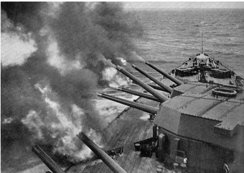
HMS Rodney, firing a salvo (Warships To-day, 1936)

It was a signal that Admiral Sir Bertram Ramsay must have been longing to send while being concerned at the potential consequences: ‘CARRY OUT OPERATION HERMETIC’. The issue of this simple order would have executed the contingency plan he had devised as Allied Naval Commander, Expeditionary Force to counter any attempt by the remaining major warships of the German Navy to attack the D-Day landings. It was one of the most interesting papers I discovered in the National Archives at Kew (in AIR 37/1453) while I was researching some primary material for the introduction of my volume on Operation NEPTUNE. Not least, it helps to counter the inaccurate but frequently held assumption that battleships were obsolete in the age of air power and were by this stage of the war entirely lacking a role in naval strategy.