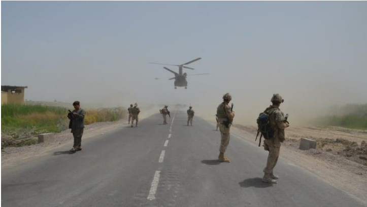
A Canadian CH-147 Chinook helicopter takes off outside a combat outpost in Panjwaii, Afghanistan in June 2011.