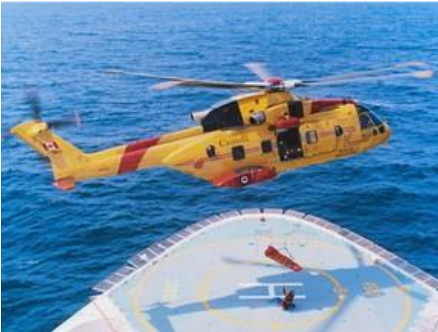
In 2020, DND informed aerospace firm Leonardo that its proposal to modernize the Canadian military's search and rescue helicopters was unaffordable.

Officials with Leonardo, the Italian aerospace firm whose subsidiaries originally built the CH-149 Cormorants, were not immediately available for comment. The CH-149 Cormorant fleet entered service in the year 2000. Canada originally bought 15 Cormorants, but one crashed in 2006. The project would have seen the CH-149s upgraded to a design being used by Norway for its search and rescue missions. Using an already established configuration would have allowed the project to proceed faster, according to DND officials. The modernization program was to have included improved sensors and upgrades to navigation systems, communication systems, and flight recorder systems to comply with new Canadian, US and European airspace regulatory requirements. A new avionics suite with improved navigation and communications systems would also have been installed.