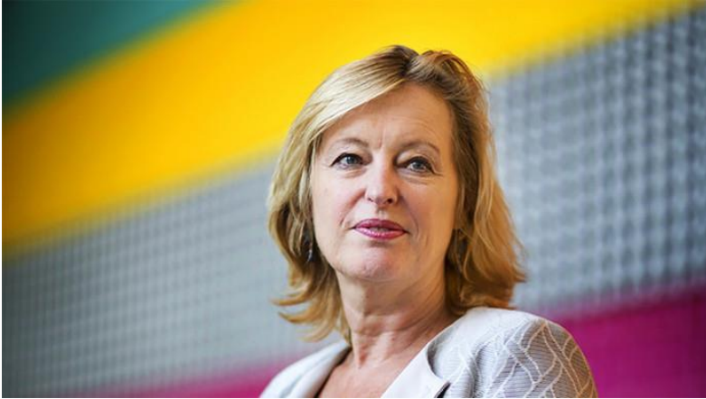
Dutch politician Jet Bussemaker.

owns it. However again, we couldn't find any one general rule for it, with some legal professors saying that there's a lack of international law regarding wrecks.