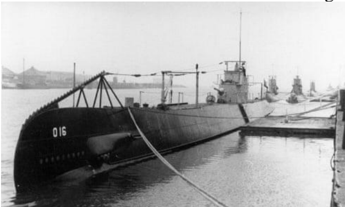
The O16 submarine in its prime.

The two Dutch shipwrecks were that of two World War 2 era submarines: the HNLMS O 16 and HNLMS K XVII. These ships were built in the early 1930s, with the K XV11 being the older of the two, while the O 16 was an improvement on its older sibling that was bigger and faster. The Dutch would later send them to become the pride of their submarine fleet patrolling the Dutch East Indies by the late 1930s. The K XV11 was also quite controversial, with a number of conspiracy theories about how it actually saw the Japanese troops heading over to Pearl Harbor. Sadly, both of these submarines were sunk in 1941 by Japanese mines near Pulau Tioman, and these shipwrecks were also the final resting grounds for the 79 men who were onboard. The disappearance came to light when a group of Dutch and Malaysian expedition members were investigating a possible disturbance in the area surrounding the shipwrecks, and discovered that the pair of almost 80-year old wreckages were no longer there. What's left was just an outline in the seabed and a few remains of one of the shipwrecks in the ocean. The remains of the 79 crewmen are now missing as well.