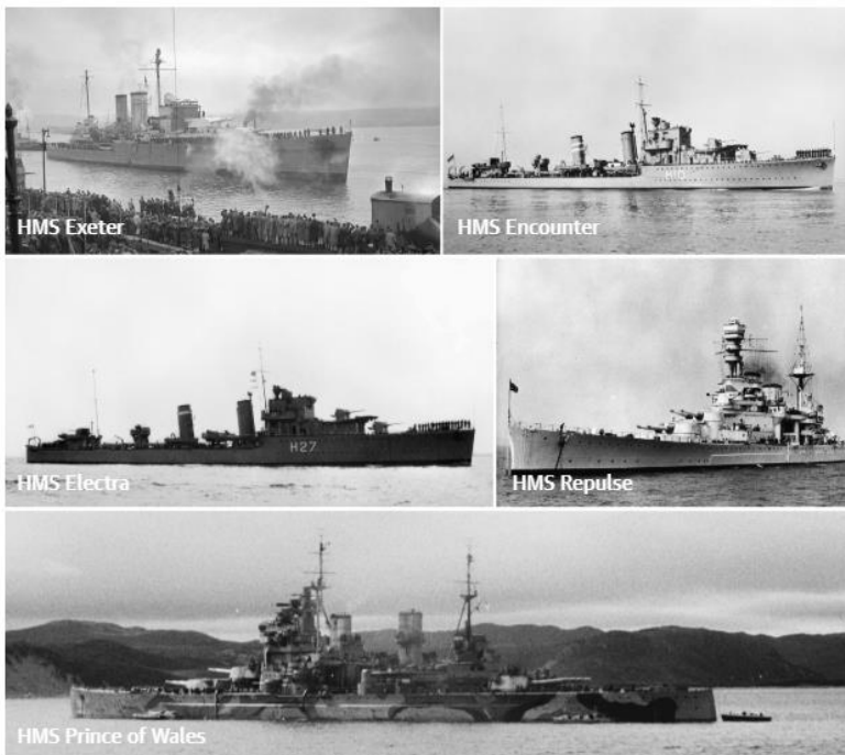
Some of the British ships in the region's waters that have been damaged by scavengers.

not come as a surprise given the history of salvaging in the region. “It is a very sad message. It is shocking to all the relatives, but at the same time it does not surprise me at all. I am now also just a surviving relative. This is very bad. It gives no rest this way. That boat was the grave,” – Jet Bussemaker, Dutch politician, as quoted by the Guardian. Adding more salt to the wound is the fact that just earlier this year, the Dutch foreign minister Stef Blok had come to Kuala Lumpur to sign an agreement with the Malaysian govt. One of the points discussed was the protection of these Dutch shipwrecks that are considered war graves in our waters. Blok even thanked us for protecting the shipwrecks..... *awkward* So is there really no more hope for these shipwrecks to be protected? It's hard to enforce the law in an ocean so big, but proper legislation would be a good start. The ocean is huge, that's a given. As such, it's no surprise that despite the numerous international laws protecting these wartime shipwrecks, scavengers and looters have still managed to destroy and sell off the scrap metal from these wrecks. Indonesia, another country having to deal with looters desecrating WW2 shipwrecks, has argued in the past that they do not have the resources to patrol them when there's other threats to deal with such as smuggling and illegal fishing.