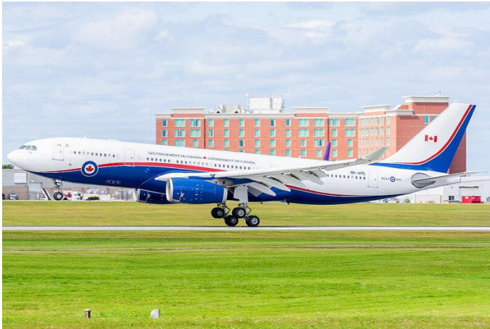
The first CC-330 Husky arriving in Ottawa (CYOW) on Aug 31, 2023.

requirements. Among the five used A330-200s, two were acquired by Canada in July 2022 for US$102 million. A year later, three more were purchased for $150 million US. The aircraft were all previously operated by Kuwait Airways and acquired through International AirFinance Corporation.