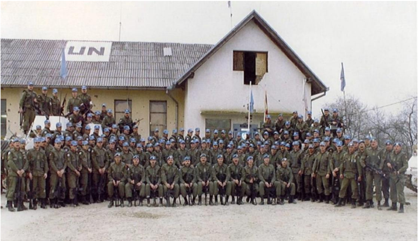
The soldiers of Charlie Company in front of their headquarters in early 1993. In August, they would move to Croatia's south and later take part in Canada's largest battle since the Korean War.