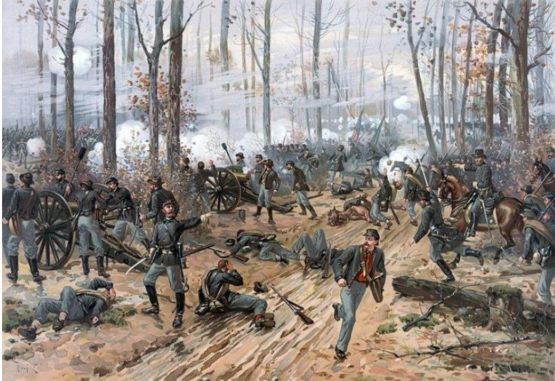
The Battle of Shiloh

explanation, but it took almost 140 years and the work of two high school science students to find out why.