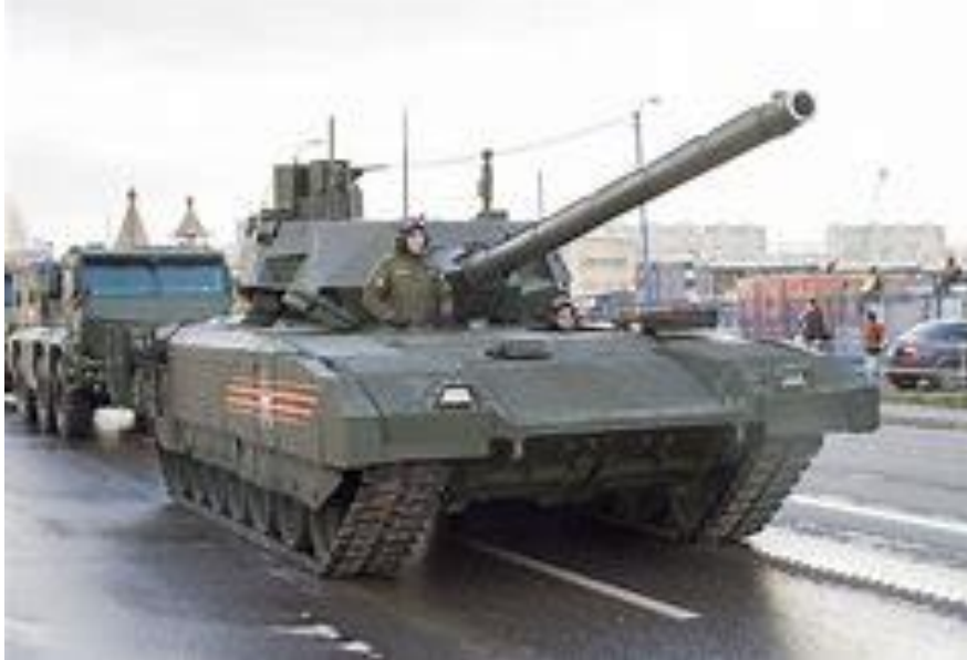
Russian T-14 tanks drive during rehearsal for the Victory Day parade in Moscow.

Ryan Pickrell, Business Insider March 07, 2019