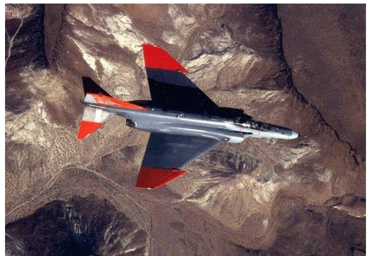
A QF-4 Drone in flight as it is tracked by a missile at Tyndall AFB, Fla. The drones are used as moving targets to test weapons.

When entering enemy airspace filled with counter-air systems, the Valkyrie could conceivably soak up enemy fire or even attack enemy positions and aircraft. The F-35 has been touted by the Air Force chief of staff as the “quarterback of the joint team,” and not simply another stealth aircraft. The fifth-generation fighter is expected to come with a suite of information fusion capabilities, enabling its pilot to process information and coordinate on the battlefield like never before. Valkyrie is the product of a partnership between the Air Force Research Laboratory out of Wright-Patterson Air Force Base in Ohio, and a private firm: Kratos Unmanned Aerial Systems. Kratos has also been involved in the Defense Department’s push for drone swarms under the Gremlin program. The joint project is part of the Air Force’s effort to “break the escalating cost trajectory of tactically relevant aircraft,” according to an Air Force Research Lab news release. “XQ-58A is the first example of a class of UAV that is defined by low procurement and operating costs while providing game changing combat capability,” Doug Szczublewski, AFRL’s XQ-58A program manager, said in a statement. The time to first flight took a little over two and half years from the issuance of the roughly $40 million contract award. During its first flight, the aircraft behaved normally and flew for 76 minutes, according to AFRL.