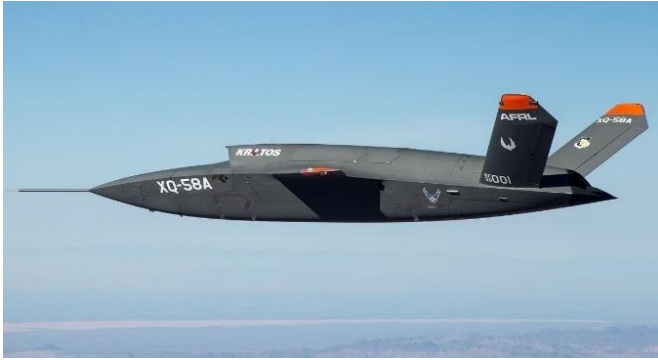
The XQ-58A Valkyrie demonstrator, a long-range, high subsonic unmanned air vehicle completed its inaugural flight March 5 at Yuma Proving Grounds, Arizona.

intelligence. But the airspace over future battlefields will likely not be permissive, and so new drones will need to be developed. XQ-58A Valkyries were developed under the low-cost attritable aircraft technology program — meaning they’re cheap and can be lost in combat without too much concern. The drone and its derivatives are anticipated to perform a range of missions, including suppression of enemy air defenses, offensive and defensive counter-air maneuvers, nap-of-the-earth or terrain masking flight and high-altitude flying. The Valkyrie appears to come with a stealthy, low radar signature design, meaning it may be able to be paired with the F-35 Joint Strike Fighter in a manned-unmanned configuration.