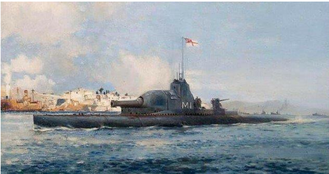
M1 with 12-inch Gun © IWM (Art.IWM ART 3065)

During the last months of the first world war, the Royal Navy built the M-Class submarines, sometimes called submarine monitors. These were diesel-electric submarines with a rather unique feature; they had a 12-inch gun mounted in a turret forward of the conning tower and the M-class submarines are. They were initially intended to bombardment the enemies coast, but their role had been changed before detailed design begun. The new idea was that the submarine could engage merchant ships with the gun while remaining at periscope depth. Alternatively, it could surface and fire the gun, rather than with the use of torpedoes. At that time, torpedoes were considered ineffective against moving warships at more than 1,000 yards distance.