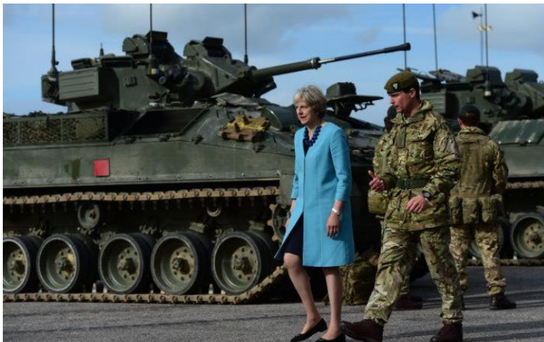
Theresa May visiting 1st Battalion The Mercian Regiment at Bulford Camp, Salisbury Plain