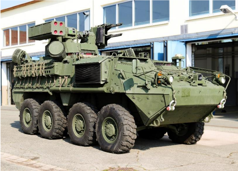
The 5 th Battalion, 4 th Air Defense Artillery Regiment (5-4 ADA), 10 th Army Air and Missile Defense Command, became the first unit in the Army to receive the Mobile Short Range Air Defense (M-SHORAD) system on April 21, 2021.