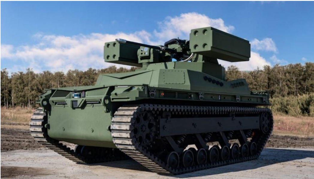
The TRX SHORAD unmanned ground vehicle.